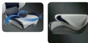
▲ Indicative picture: example of customized item.